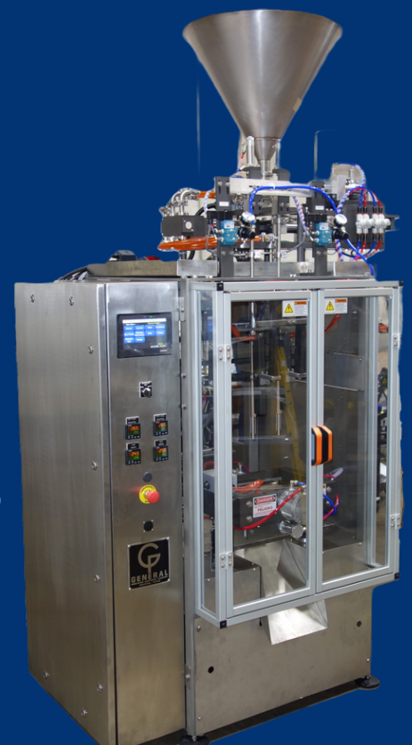
E2L2C, 2 lane: Packaging sauces