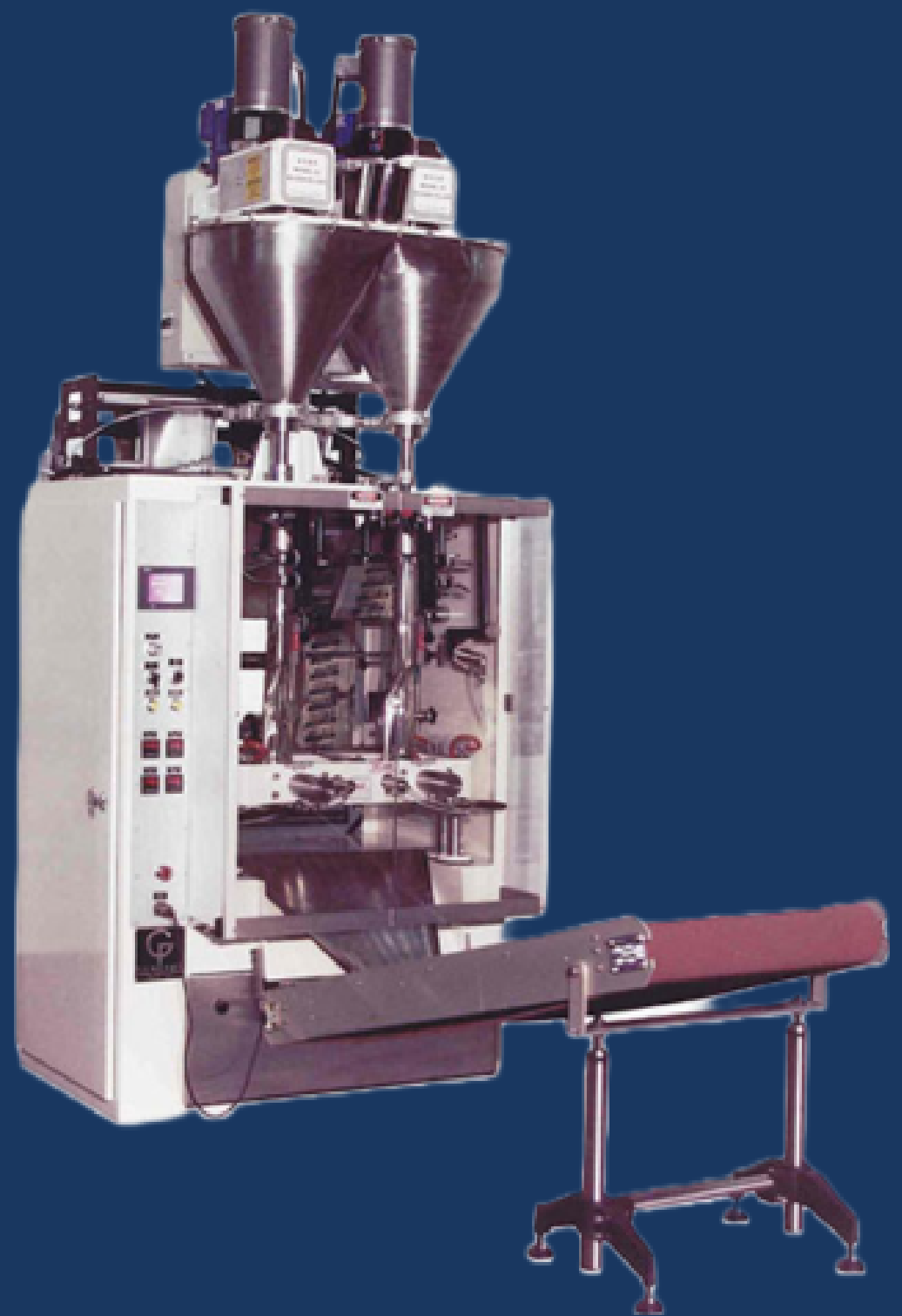
70WA2C: Packaging Pool Chemicals, 2 lane

Looking for a Specific Product? Check out our Youtube Channel!