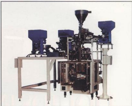
Model 48WLCF equipped with fitment applicator and pump inserting for 2 different pump designs.